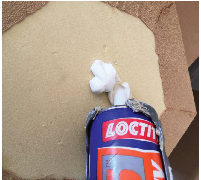
STEP 2: Apply a dab of construction adhesive to back of WallScape panel