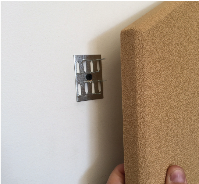
STEP 3: Level and impale WallScape panel to wall